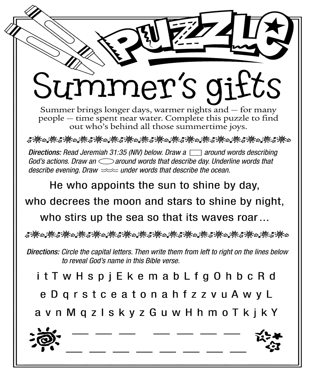
Answer: The Lord Almighty